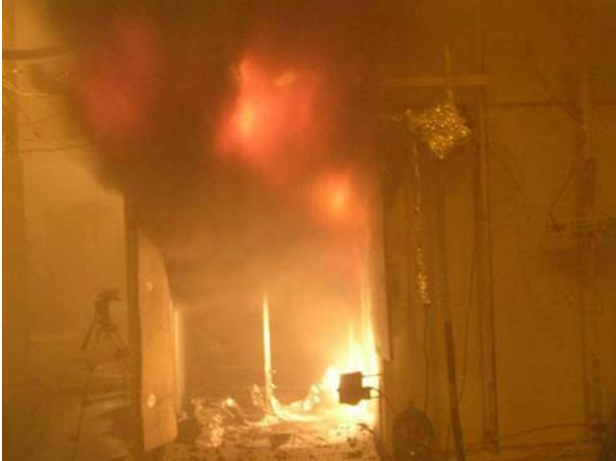
Figure 8: Flashover fire resulting from ignition of a mattress in one cabin – the flames are observed from the corridor adjacent to the cabins

panels and the aluminium floor covering to melt. However, measurements of the composite structure temperatures during the test and inspection of the fire insulation system afterwards indicate the structure was adequately fire protected, with the fire insulation system largely unaffected by the heat generated. Only a small area of the insulated composite deck above the fire zone showed any delamination of the laminate skin, it is concluded that this could be easily repaired after a fire.