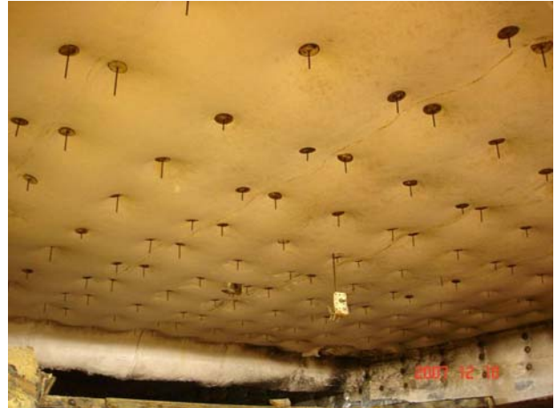
Figure 10: The fire insulation system fitted to the composite deck above the cabin showed only minor effects of exposure from heat of the fire.

This test program demonstrates that passenger ferries can utilise composite superstructures and achieve fire safety levels equivalent to steel construction. The tests did highlight some areas where it is thought existing SOLAS regulations could be improved with regard to wall coverings, flammability of mattresses, floor coverings and sprinkler systems. However, these are as equally applicable to ships built from steel or aluminium as those built from FRP composites.