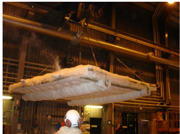
Figure 5: Composite deck removed from the fire test furnace at the end of a 60 minute fire test

Fire Tests were carried out at the SP laboratory in Sweden on a bulkhead and a deck manufactured by Kockums Shipyard in Karlskrona, Sweden; the core being supplied by DIAB (both companies are participants in LASS). A newly developed lightweight fire insulation supplied by another LASS Project partner, Thermal Ceramics, was used in order to achieve the high insulation requirements with as little weight as possible. This new insulation material, “FireMaster Marine Plus Blanket”, is a low bio persistence alkali-earth silicate fibre supplied as a flexible blanket. It is made using a process that optimises the amount of fibre produced relative to non-fibrous, glassy inclusions. This allows manufacture of low density blankets that have equivalent thermal conductivity to denser products made using conventional fabrication technology. On average, a weight reduction of 25% can be achieved when the material is used as structural fire insulation on ships.