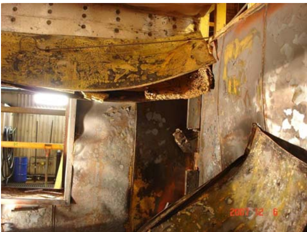
Figure 9: After the fire shown in Figure 8. Collapse of ceiling panels has occurred. The fire insulation protecting the composite structure can be seen in the top of the photograph.