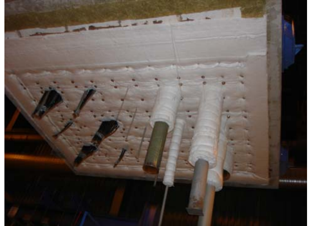
Figure 7: Composite deck fitted with multiple cable transits, pipes circular duct and DNV-approved 60 minute fire insulation system.

supplied by LASS Project Partner MCT Brattberg were installed together with steel and plastic pipes of various sizes and a circular steel duct. Both tests demonstrated that the integrity of the fire division is maintained when penetrations fitted into the fire insulation system are sealed using simple compression joints between them and the fire insulation.