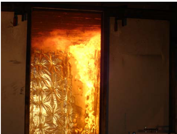
Figure 6: Room Corner Test being carried out. The fire insulation is covered with a decorative layer of aluminium foil to replicate a typical installation.

The next step in developing fully the fire insulation concept was to carry out room corner fire testing to establish what minimum insulation requirement was necessary to render the composite as "fire restricting". A successful test was carried out with a 20mm thick layer of 48 kg/m 3 blanket, a weight of less than 1 kg/m 2 .